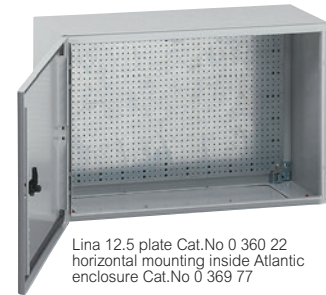
Lina 12.5 plate Cat.No 0 360 22 horizontal mounting inside Atlantic enclosure Cat.No 0 369 77

Cabinet and equipment selection chart p. 258-259 Technical characteristics p. 273