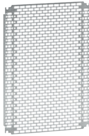
0 360 18