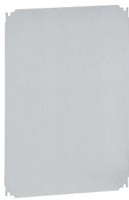
0 360 58