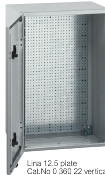
Lina 12.5 plate Cat.No 0 360 22 vertical mounting inside Atlantic enclosure Cat.No 0 369 26